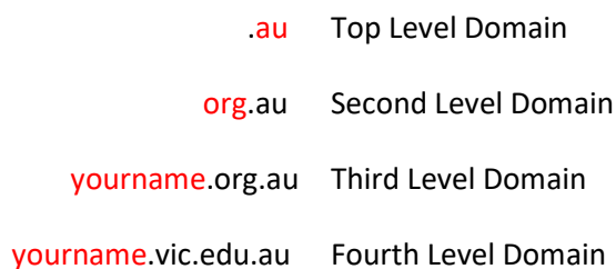
Fig 1: Levels of Domains in .au.