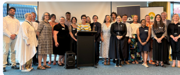
2024 Community Grant announcement

Meanwhile, in March, the Australian Government concluded its periodic review of auDA's Terms of Endorsement (ToE), which included public consultation.