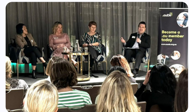
Women in Digital sponsored event in Western Australia