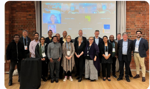
The Pacific Donor Forum hosted by auDA to support development of the internet in the Pacific