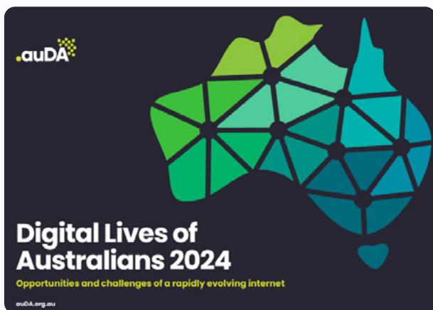
Digital Lives of Australians 2024 report

for auDA as we approach the conclusion of our 2021-25 Strategy in June 2025, and embark on formulating our next strategy during this financial year.