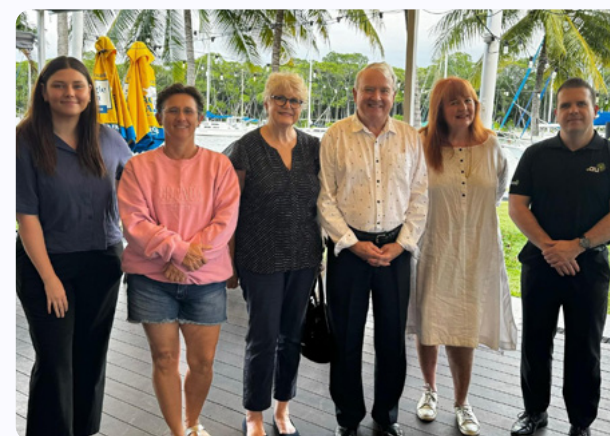
The .au member small business workshop in Port Douglas

One of our core functions at auDA is to operate a stable, secure and reliable .au domain for the benefit of all Australians. In Q4, auDA and .au registry operator, Identity Digital Australia, upgraded the .au registry to a new cloud-based platform . This platform provides greater security and resilience through increased redundancy and threat-detection.